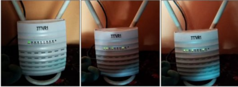
4th Jan 2021 10:35AM 4th Jan 2021 11:22AM 4th Jan 2021 2:43 PM