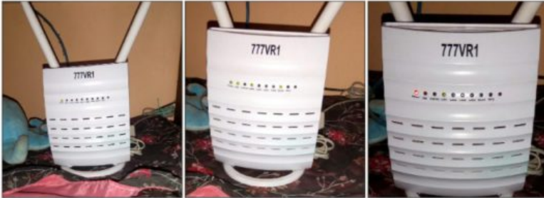
11th Jan 2021 11:00 AM 13th Jan 2021 12:50 PM 13th Jan 2021 2:36 PM