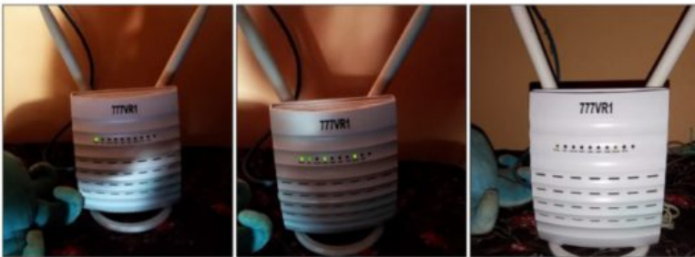
5th Jan 2021 10:40 AM 6th Jan 2021 12:20 PM 9th Jan 2021 3:40PM